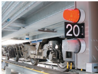
Customized control and indication systems, displaying the status of the DC supply, to suit individual depots