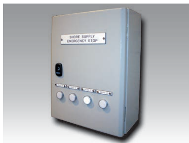
Emergency stop system for individual zones and entire depot