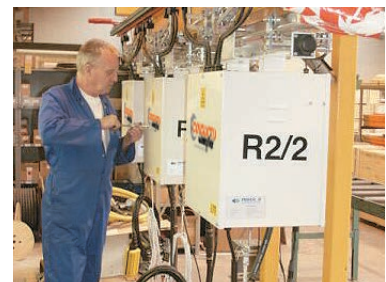
Conductix-Wampfler can offer a turnkey project from design to build, install and maintain