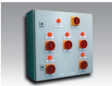
Switching and indication can be provided at remote locations e.g. Depot Manager's Office