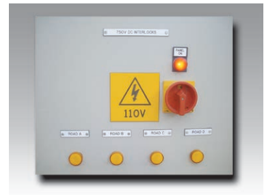
Shore supply system can be designed to interface / interlock with other depot equipment