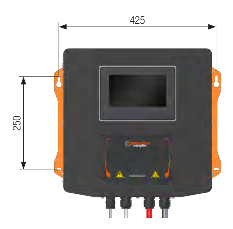
Drilling pattern for wall mounting

Mounting material is not part of the scope of delivery.